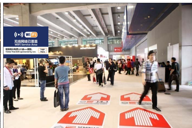
Inside the Hall 展馆内