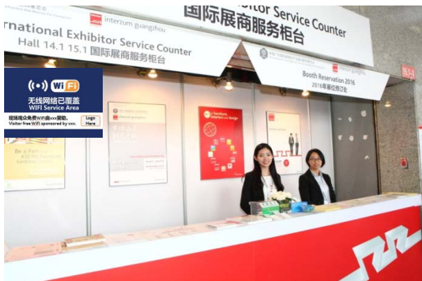
Service Counter 现场服务柜台