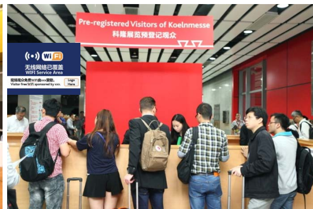
Visitor Registration Center 观众登记中心